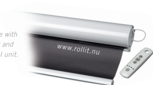
White cassette with electric motor and remote control unit.